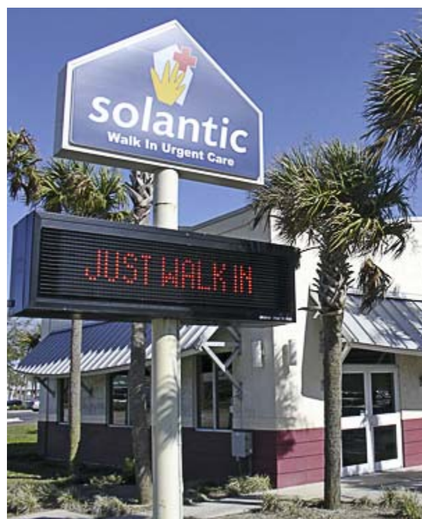
An urgent-care clinic in Atlantic Beach, Fla.